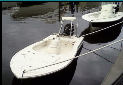
CHAOS BOATS AT THE SHOW

- We are very excited to kick off the boat show season with United Yacht Sales. We teamed up with United Yacht Sales to represent Chaos Boats for the in water display at FLIBS.